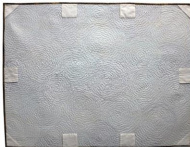
View of back of artwork