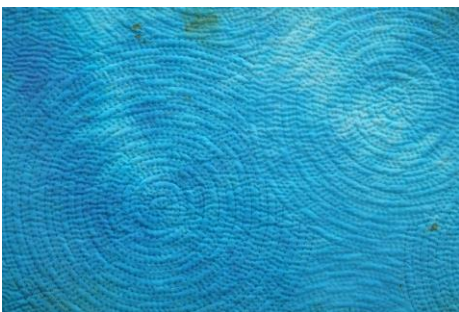
Detail image of artwork

Dense hand stitching and the liberal use of metallic thread in the swirling pattern, enhances the piece and provides it with visual and physical texture resulting in interesting shadowing effects in various lighting conditions. This textile artwork is designed to be displayed on a wall in either a vertical or horizontal orientation.